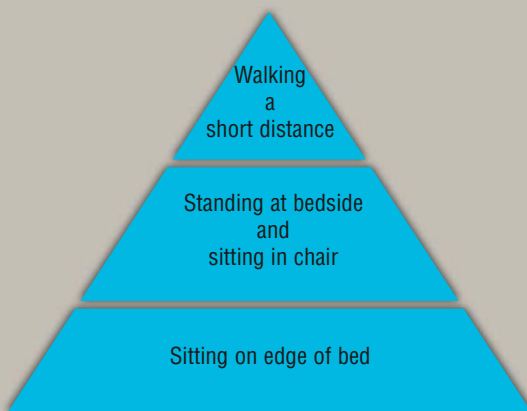
Figure 4 Early mobility hierarchy.