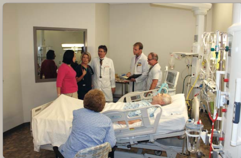
Figure 5 Rounds in intensive care unit.

daily rounds. If activity has been halted because of an acute event (see examples in Table 4), the patient is reevaluated each day until the protocol can be reinstated. Each eligible patient is encouraged to be mobile at least once a day, with the specific level of activity geared to his or her readiness. Patients progress through a 3-step process, embarking on the highest level of physical activity they can tolerate, as outlined in Figure 4. The authors suggest