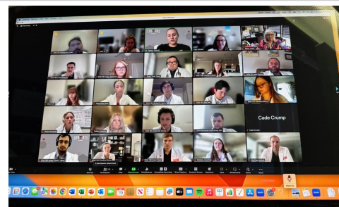
Students gather for a large-group debrief to discuss the challenges and successes of their effort to disclose medication error.